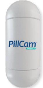
PillCam™ patency capsule

The PillCam™ capsule endoscopy platform aids to detect digestive tract diseases. PillCam™ can visualize the following conditions: