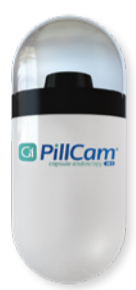
PillCam™ SB 3 capsule