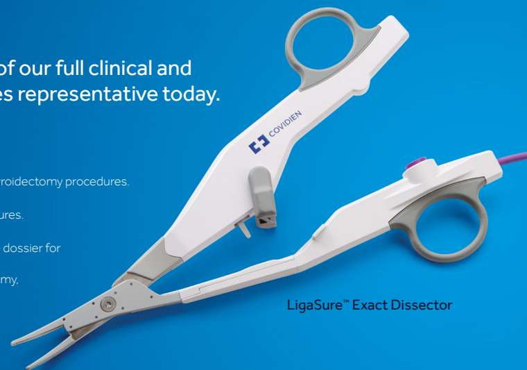
LigaSure™ Exact Dissector