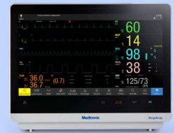
RespArray™ patient monitor

The Capnostream™ 20p and Capnostream™ 35 monitors utilize a Lithium-Ion rechargeable battery. Battery back-up time may degrade over time. To avoid degradation of battery capacity, it is recommended that the battery pack be replaced every two years for the Capnostream™ 20p. For the Capnostream™ 35, it is recommended that the battery pack be replaced every 4 years for devices in use in hospital settings and every 2 years for devices in use in EMS settings. For the RespArray™ patient monitor, it is recommended to replace the lithium battery after 300 charge-discharge cycles.