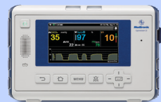
Capnostream™ 35 portable respiratory monitor