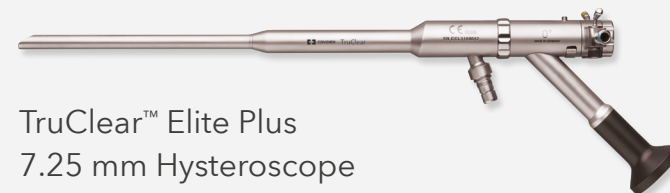
TruClear™ Elite Plus 7.25 mm Hysteroscope

TruClear™ Elite mini insert has long "golf tee" neck