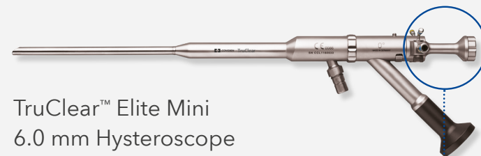
TruClear™ Elite Mini 6.0 mm Hysteroscope

©2022 Medtronic. Medtronic, Medtronic logo, and Engineering the extraordinary are trademarks of Medtronic. All other brands are trademarks of a Medtronic company. 01/2022 - US-UW-2100196 - [WF# 6155768]