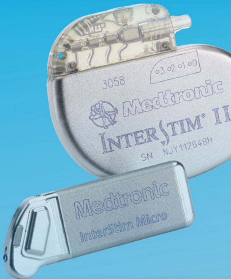
InterStim™ Micro Neurostimulator